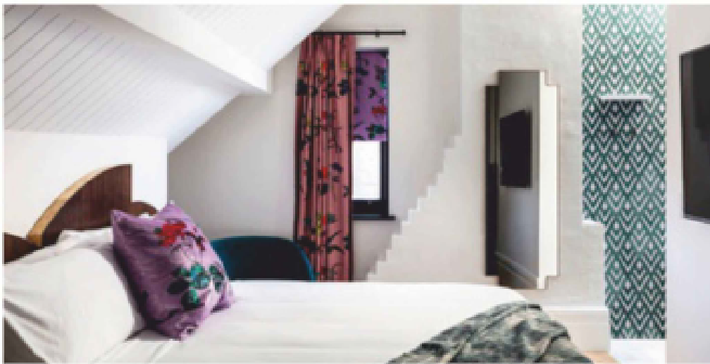
004 TOP: Stylish bathrooms; each room at Little Albion is individual in design